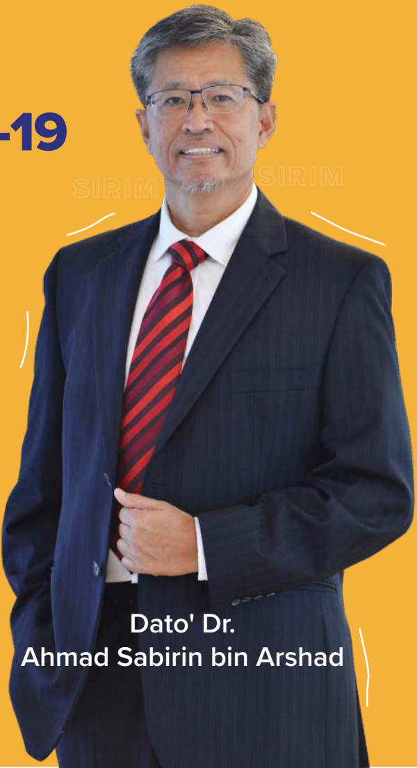
Dato' Dr. Ahmad Sabirin bin Arshad

The Full Movement Control Order (FMCO) which the Government has implemented from 2 June to 14 June is critical to bringing down the infection rate and flattening the curve. And each and everyone of us must play our part.