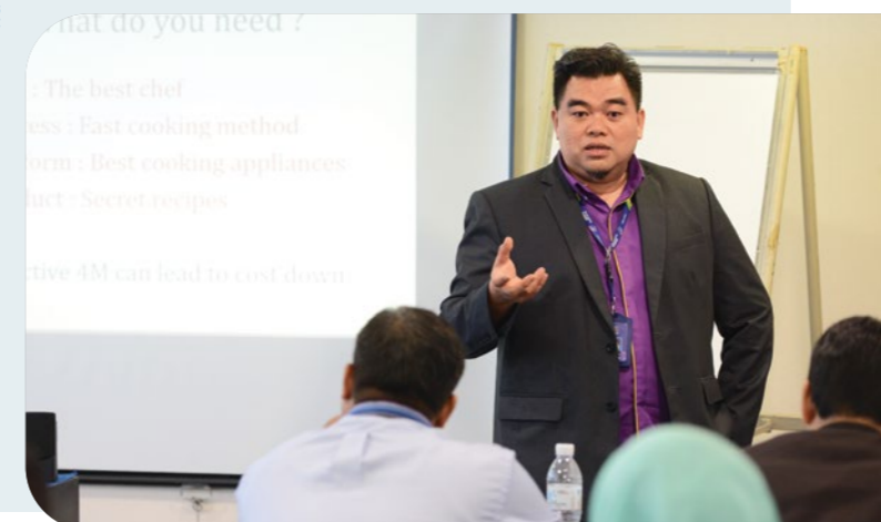
SIRIM STS carries out training programmes to help participants from industries understand how to implement standards in their organisations.

Furthermore, aside from developing standards, SIRIM STS also offers training courses for organisations seeking certification. “Through our training courses, organisations can strengthen their products and processes that will help them through the TIC exercise and get certified accordingly,” Raja Yahya states.