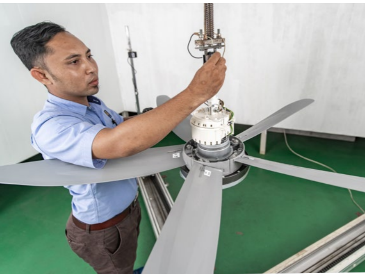
As the leading testing, inspection and certification (TIC) provider in Malaysia, SIRIM QAS International helps ascertain the quality of goods, processes and services.