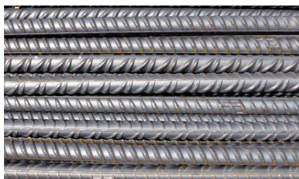
Figure 2: Without bar marking = non-certified.